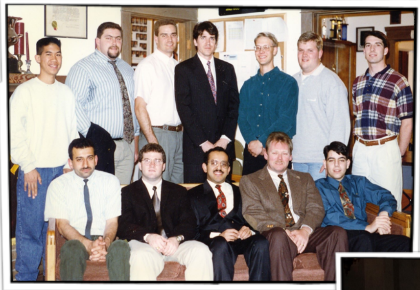
➔ PLEDGE CLASS OF 1995