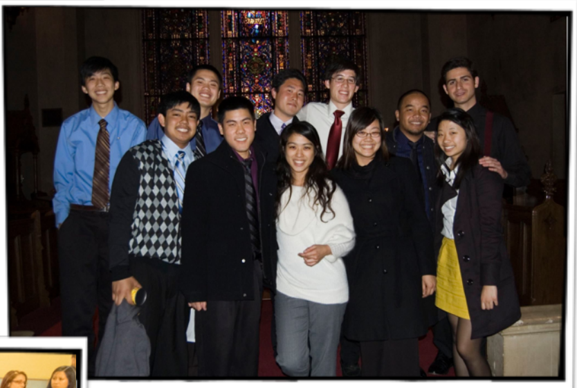
PLEDGE CLASS OF 2009 ➔