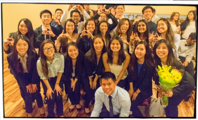
➔ PLEDGE CLASS OF 2016

Find out how you can be a part of this year's sure-to-be unforgettable 60 th anniversary celebration! ➔