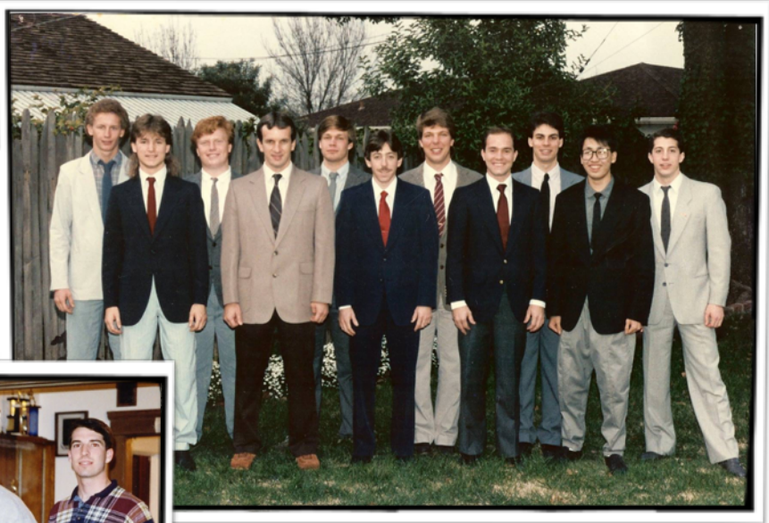
PLEDGE CLASS OF 1987 ➔