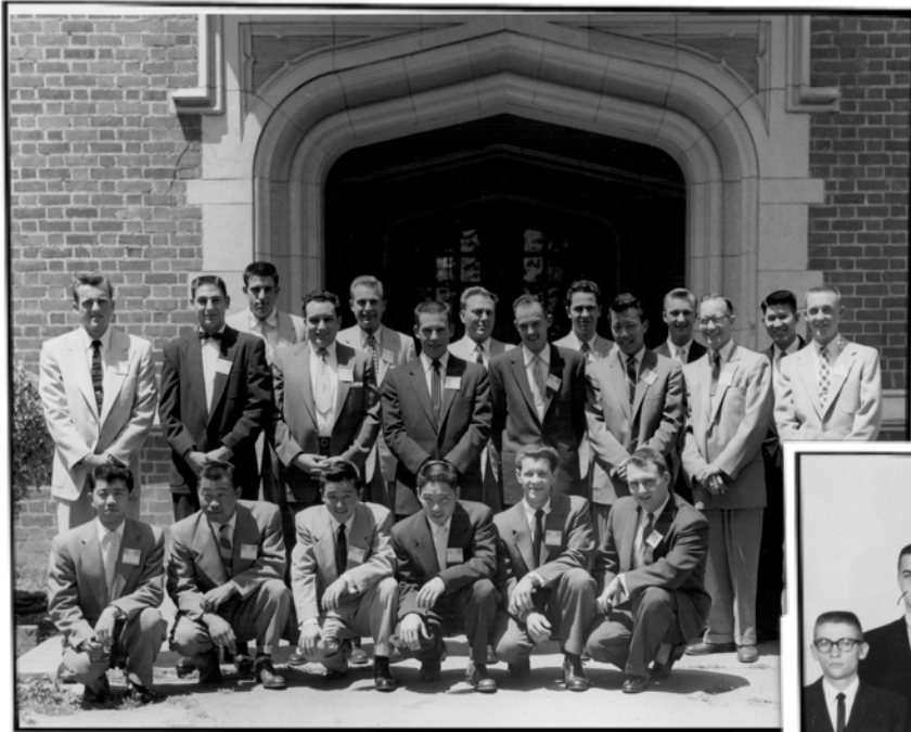
PLEDGE CLASS OF 1964 →